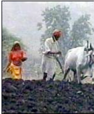
Farmland will be submerged once the dam is complete

NBA activists say the dams will submerge forest farmland, disrupt downstream fisheries and possibly inundate and salinate land along the canals, increasing the prospect of insect-borne diseases.