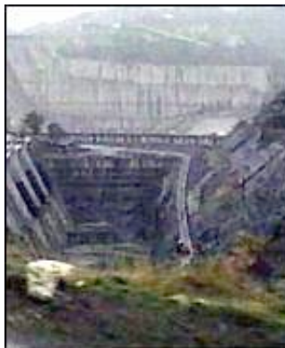
A massive undertaking

Several other international financial institutions also pulled out citing human and environmental concerns.